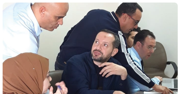
Training workshop on the operational enhanced Composite Drought Index (eCDI) at IWMI's office in Cairo, Egypt.

The first step towards developing the eCDI involved collecting meteorological and vegetation data from satellites, ground observations and computer models. The data sources for the drought indicators were selected based on data availability in terms of timeliness and historical record, and quality. This relatively long time-series was needed to capture the range of conditions and the drought intensity in each area.