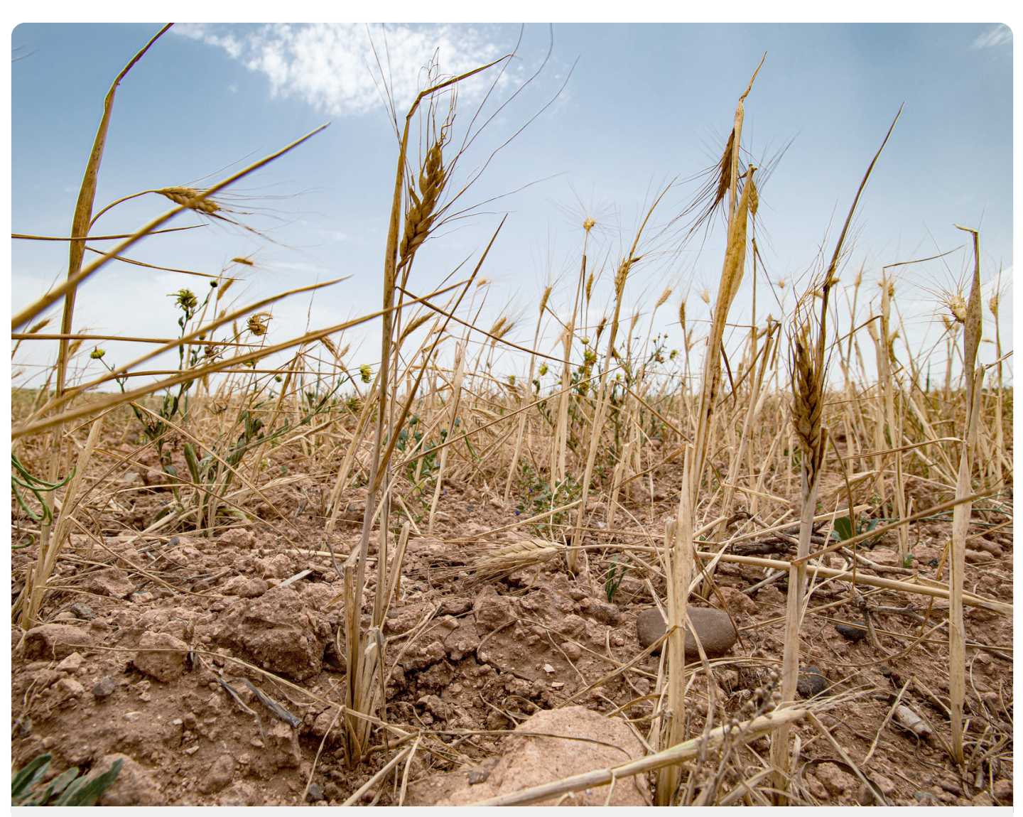
Failed wheat crop, Morocco, 2019 (photo: Michael Major/Crop Trust).

The recommended mitigation measures focus heavily on regulatory enforcement and associated social norms, primarily related to groundwater abstraction. For example, they include information campaigns to raise awareness of water sustainability issues, normalize compliance with regulations, and increase acceptance of the values underpinning the regulations. Likewise, they include supporting social processes and multi-stakeholder platforms related to long-term water use.