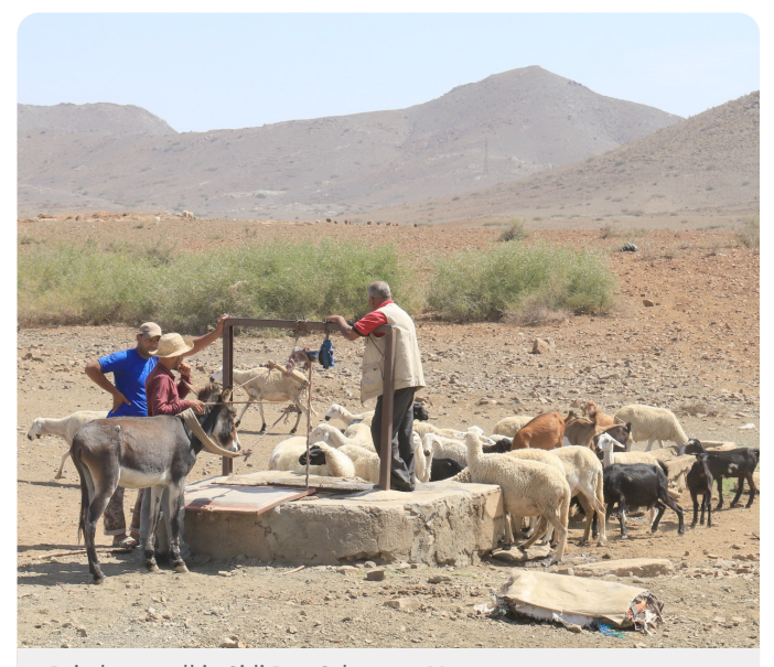
Dried out well in Sidi Bou Othmane, Morocco.

MENAdrought has developed a crop type mapping software that generates maps that are used as an input for drought vulnerability assessments and a market information system. The Directorate of Strategy and Statistics staff of the Moroccan Ministry of Agriculture will run this procedure at regular intervals to identify the location and area of major crop types and to monitor and predict crop yield and fallow pasture/rotation dynamics.