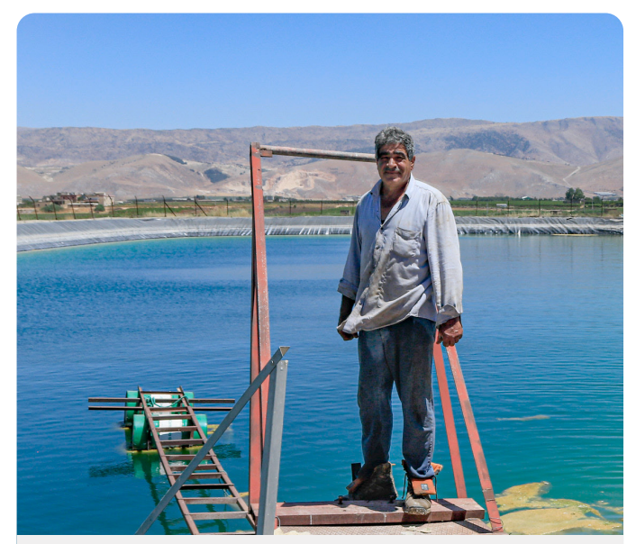
Farmer in front of his artificial lake for agricultural use in Bekaa, Lebanon ( photo: Lien Arits/IWMI).

The MENAdrought team also developed convolutional neural network (CNN) models to improve the outputs of global precipitation forecasts for Lebanon. The project's CNN model can accurately forecast precipitation with lead times of 2.5 months in semi-arid to subhumid agroecological zones. This precipitation data could be used in hydrological models to predict streamflow or agricultural models to predict crop yield and production.