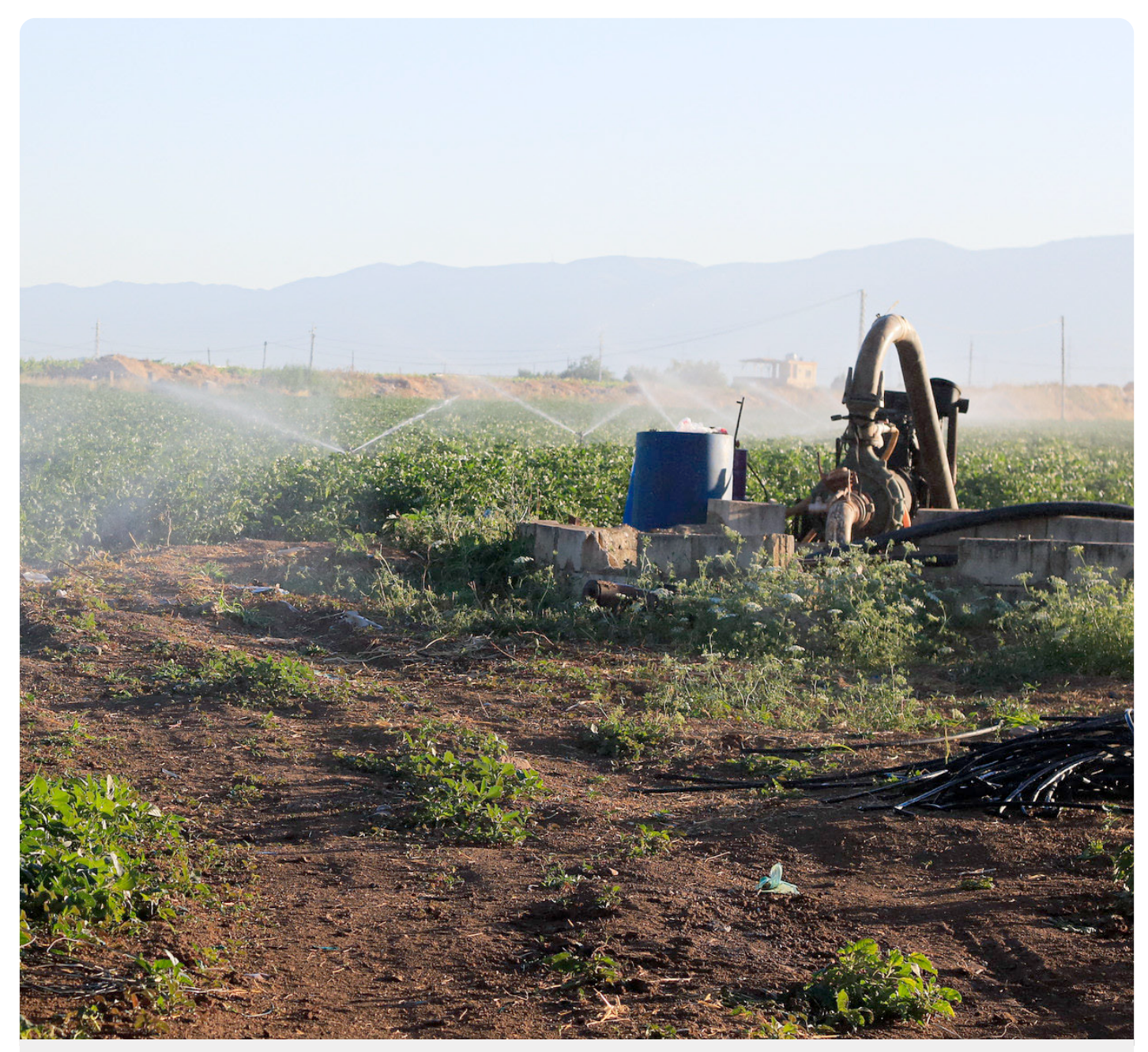
Sprinkler irrigation use in a potato field in Bekaa, Lebanon.

The Lebanese DAP's preparedness actions include actions related to legislation, policy, governance, coordination mechanisms, data collection and information sharing, and policy effectiveness.